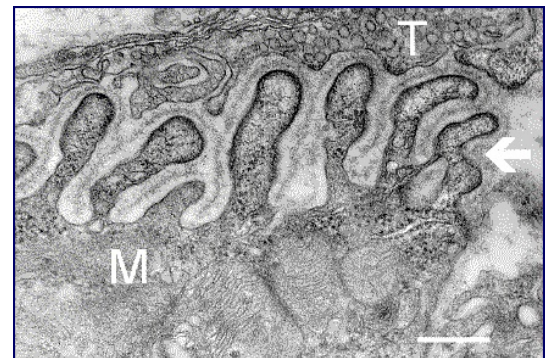
Electron micrograph showing a cross-section through the neuromuscular junction. T is the axon terminal. M is the muscle.

In the 1950s, scientists discovered that injecting tiny amounts of purified BoNT into the neuromuscular junction causes the muscle to not be able to move. That is, it paralyzes the muscle. In the 1970s, a scientist experimented with BoNT type-A (see a later section for more information on the different types of BoNT) in animals and, in 1980, used a form of BoNT type-A for the first time to treat crossed eyes (strabismus) in a person. After scientists completed more research, the US Food and Drug Administration (FDA) approved the use of one form of BoNT type-A, originally called Oculinum (this same substance is now called onabotulinumtoxinA or Botox) for the treatment of strabismus and blepharospasm in 1989. The FDA also approved the use of onabotulinumtoxinA for the treatment of cervical dystonia in 2000, and for the treatment of spasticity in the flexor muscles of the elbow, wrist, and fingers in 2010.