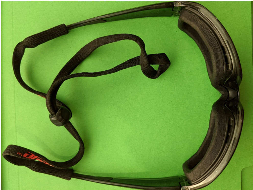
Moisture chamber glasses with strap